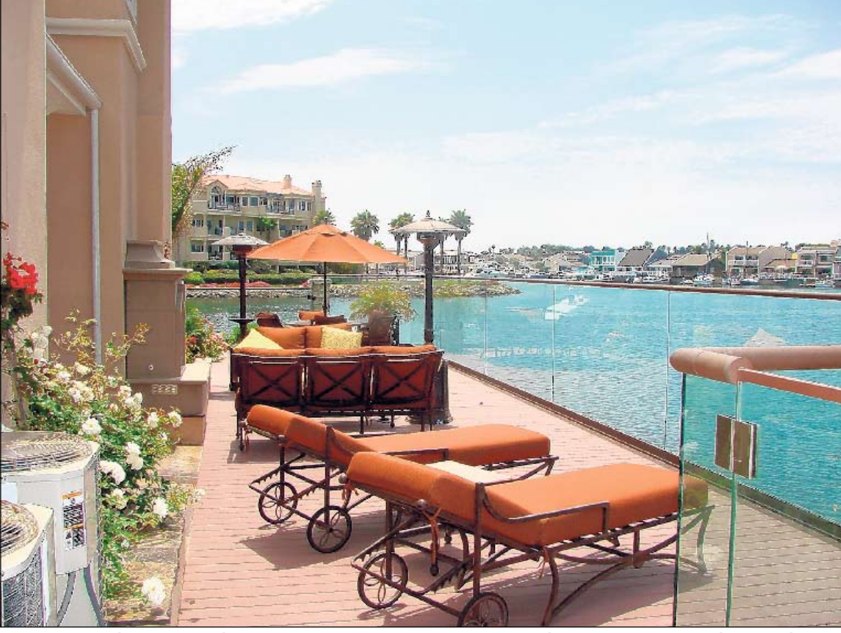
A weather-resistant material was used to construct the deck which wraps around this dockside home to make it durable, low-maintenance and a gorgeous environment for entertaining.

Through another set of French doors, guests will find a magnificent gathering area on an enormous deck complete with dock access. This deck wraps around the home with a gentle curve making it seem as one space welcoming relaxation and a inspiring leisure. Here the view is incredible and the atmosphere is undeniable. The deck includes everything that might be necessary for entertaining day and night. A fireplace looms, serving to warm the cool evening air that settles into the marina throughout the year and is complimented by a large seating area that can accommodate upwards of twenty guests if need be.