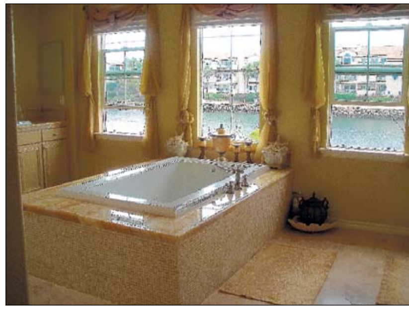
The entire home features panoramic views of the marina and the channel, but one of the most impressive views can be found in the master bathroom, above, from the Jaccuzzi tub.